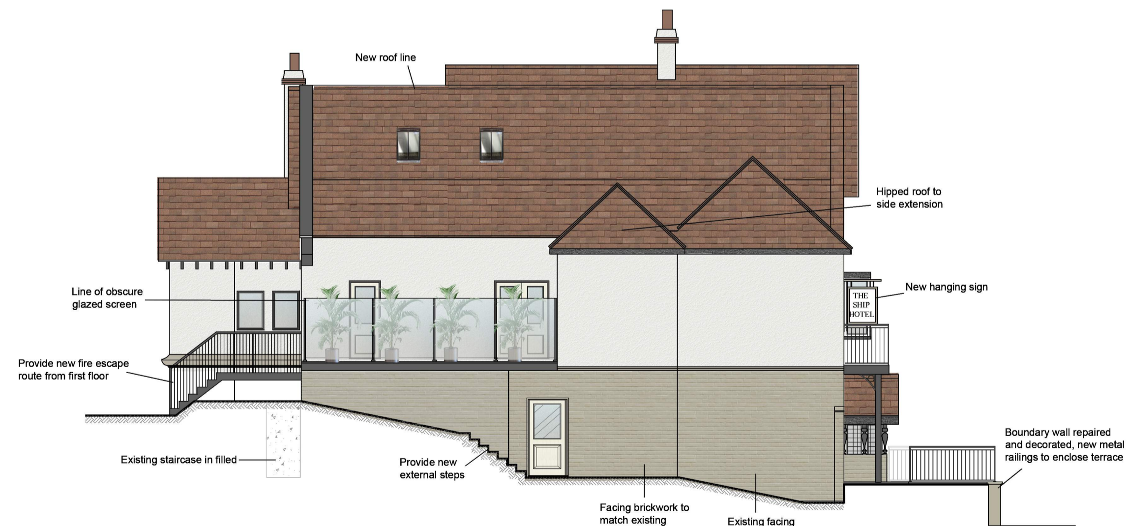
Proposed Side (W) Elevation Scale 1:100